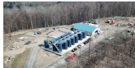
Pictured: 3rd study Area, Plum Injection Well.

In September, the Allegheny County Court of Common Pleas issued an order returning the Sedat 4a injection well permit back to Plum Borough Zoning Hearing Board for clarification of its original Findings of Fact and Conclusions of Law. The Board had the option to draw conclusions from the original hearing held in 2022, or conduct another hearing. The Board decided to conduct another hearing that will likely take place in November. Protect PT will participate in the hearing on behalf of its members and resident with concerns should attend and plan to voice their concerns.