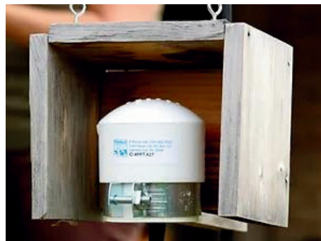
Pictured: Particulate Matter Monitor (Purple Air)

By analyzing what pollutants are in the air, we hope to find how to advocate for stricter regulations that protect people's health by giving them access to clean air.