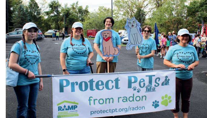
Pictured: Protect PT staff and volunteers at the Fall Festival parade.

In September, Protect PT staff and volunteers had a BLAST at the Penn Township Fall Festival! Did you stop by our booth or see us at the parade?