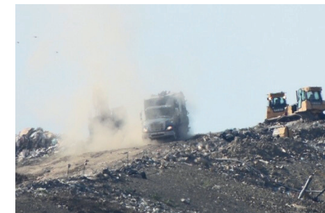
Pictured: Image of WSL taken by local resident

WSL has accepted fracking waste since 2010 and has frequently failed to safely dispose of the generated