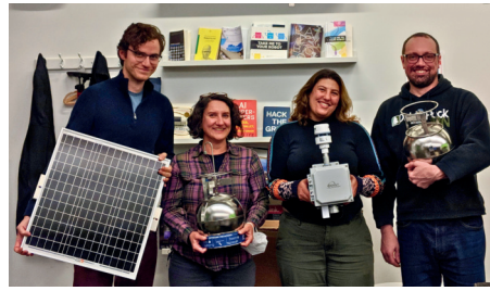
Pictured: CAFA Study Team with Study Equipment