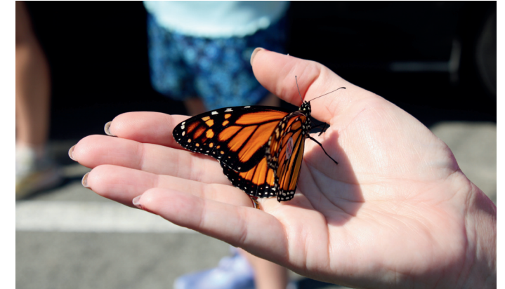
Pictured: Tagged monarch butterfly from Monarchs on the Move Event