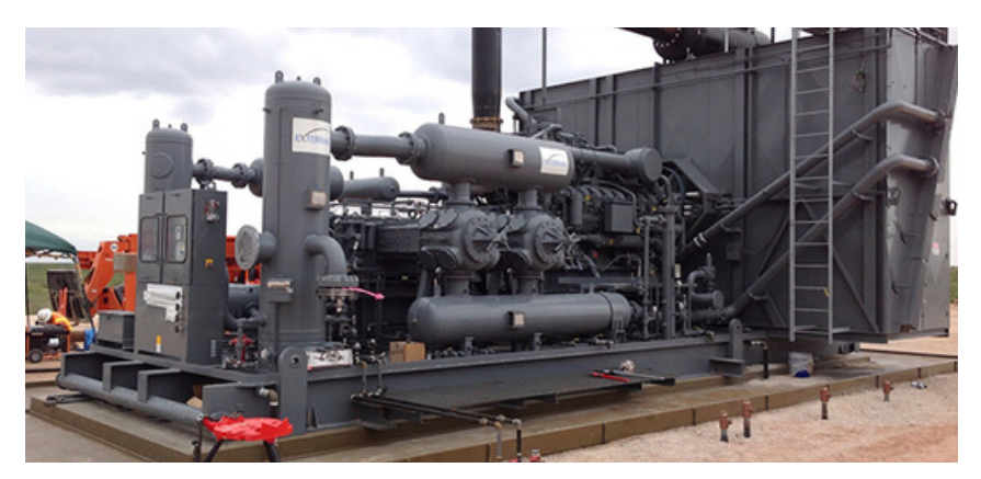
EXAMPLES OF INDUSTRIAL COMPRESSOR STATIONS THAT WILL BE ALLOWED IN CLOSE PROXIMITY TO YOUR RURAL HOME

Penn Township Commissioners are proposing to rezone a large part of the north-east corner of the Township from Rural Resource to Industrial Commerce . The proposed rezoning will impact residents living near Frye, Bouquet, Walton, Dutch Hollow and Slack Roads.